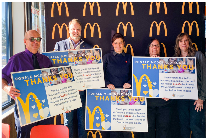
Pictured: GBS Restaurant Management