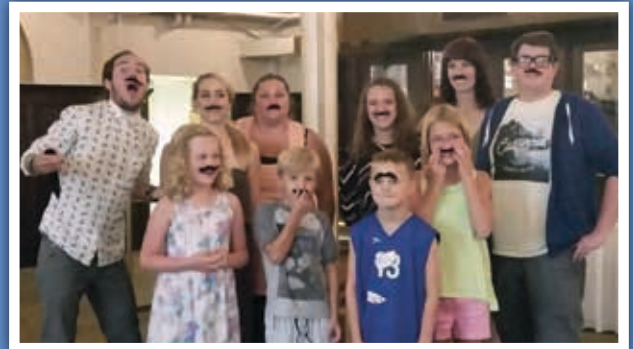
The "Mustache Gang" at the 3rd Annual YPB Bingo—just one of many fun ways the YPB raises money to support the House!

For more information, please visit ypbindy.com or email rmoehle@rmhindiana.org .